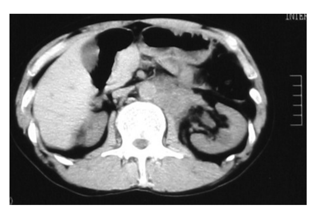
Fig.1d April 10, 2000