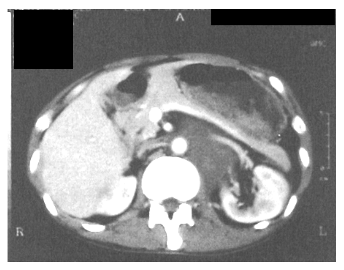
Fig. 1c June 4, 1999